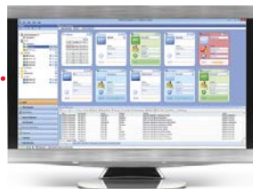
Trbonet dispatch solution