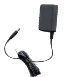
Switching Power Adapter