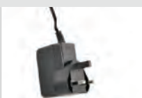
Switching power adapter for charger PS1044