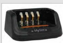
MCU Rapid-Rate Charger CH10A07