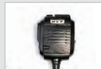
External microphone & speaker SM131M