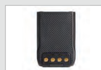
Lithium-ion battery (2000mAh) BL2010