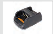
Dual charger PS2005