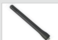
Antenna (UHF or VHF)