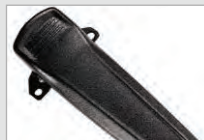
Belt clip BC08