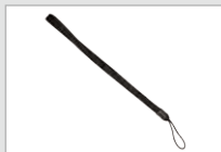
Hand strap RO03