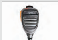
Remote speaker microphone SM26M1