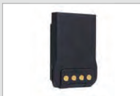
Lithium-ion battery (1500mAh) BL1504