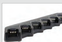
Six-Unit Charger Including Power Adapter MCA08