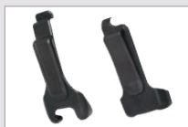
Belt clip BC20/BC21