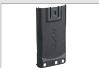
Lithium-Ion Battery (1500mAh) BL1504