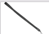
Hand strap RO03