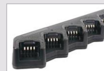
6-unit charger MCA08