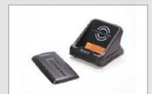
Wireless charging kit POA113