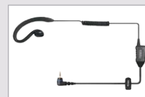
Earphone with C-clip EHS16