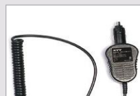
Vehicle power adapter for charger CHV09