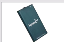
Lithium-ion battery (2000 mAh) BL2009