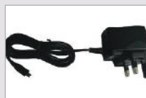
Universal Switching Power Adapter (Micro USB)