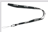
Hand strap RO01