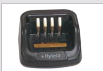
MCU Rapid-Rate Charger CH10A07