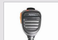
Speaker microphone SM26M1