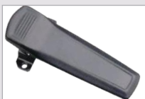
Belt clip BC08