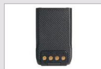
Lithium-ion battery (2000 mAh) BL2010