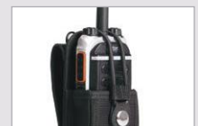
Carrying case (nylon) NCN011