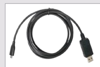
Programming cable (USB) PC69