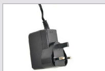
Switching power adapter for charger PS1044