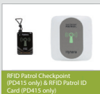
RFID Patrol Checkpoint (PD415 only) & RFID Patrol ID Card (PD415 only)