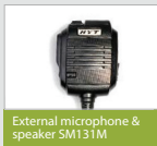
External microphone & speaker SM131M