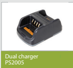
Dual charger PS2005