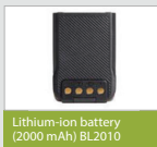
Lithium-ion battery (2000 mAh) BL2010